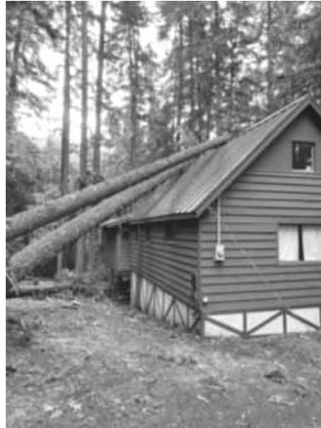
Deep Creek 22