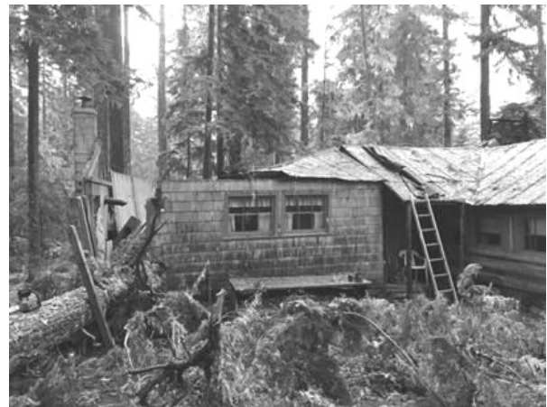
Goat Creek 16