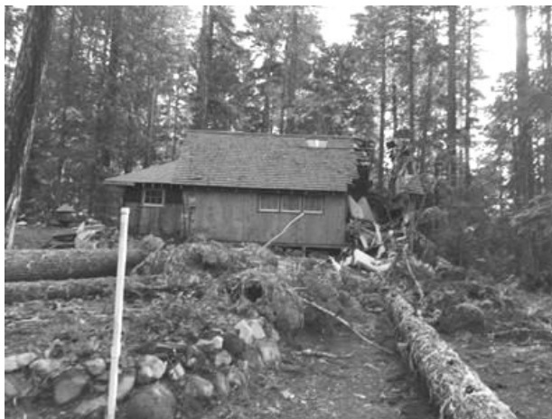
Deep Creek 6